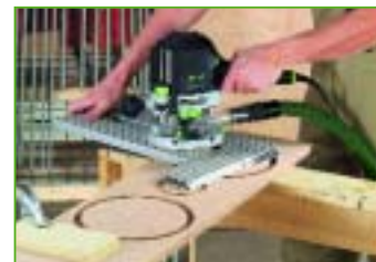
Simple routing of circles: set radius, mount OF 1400 with copying ring.

With a routing stroke of 70 mm , this new router is cut out for many applications. For example: recessing of metal fittings on windows and doors with deep rebates. This compensates for the usable routing depth that is lost when routing templates are used.