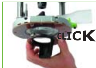
A simple click and the chip catcher is fitted.