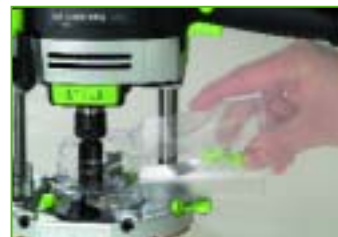
The extractor hood can also be used with the router installed.

Here, the advantages of the bar handle and the extractor hose running parallel to it are demonstrated: they ensure unimpeded work and optimised handling.