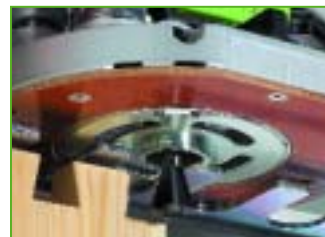
A simple click and the copying ring is fitted.