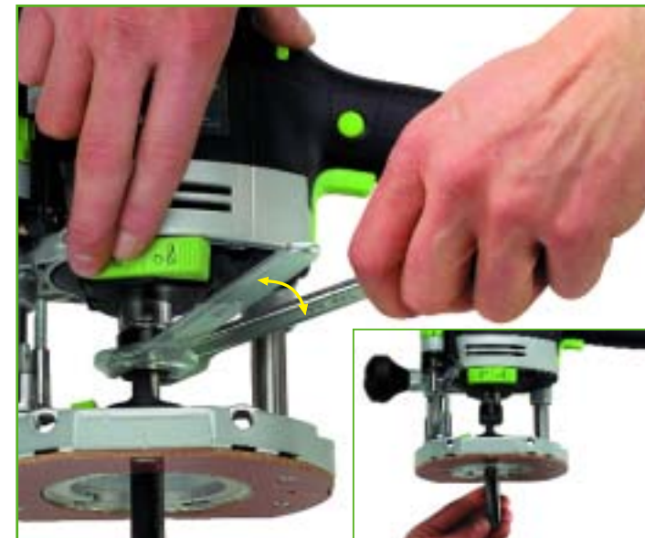
Thanks to the ratchet technique, router bit changing is comfortable, fast and safe.

Now router and clamping collets can be changed easily and quickly. In the range from 6.35 mm to 12.7 mm, all common clamping collets can be used with the OF 1400.