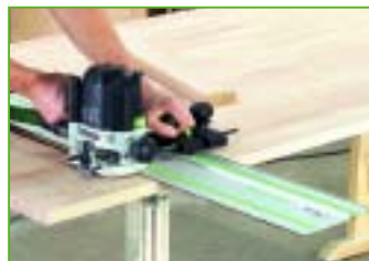
Routing of tilting fillets or angled grooves: no problem with the guide system.