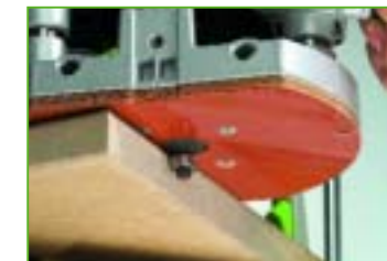
Simply fit it: tool-free change between base runner and copying ring (also available for jointing system VS 600).

Routing with more precision is not possible!